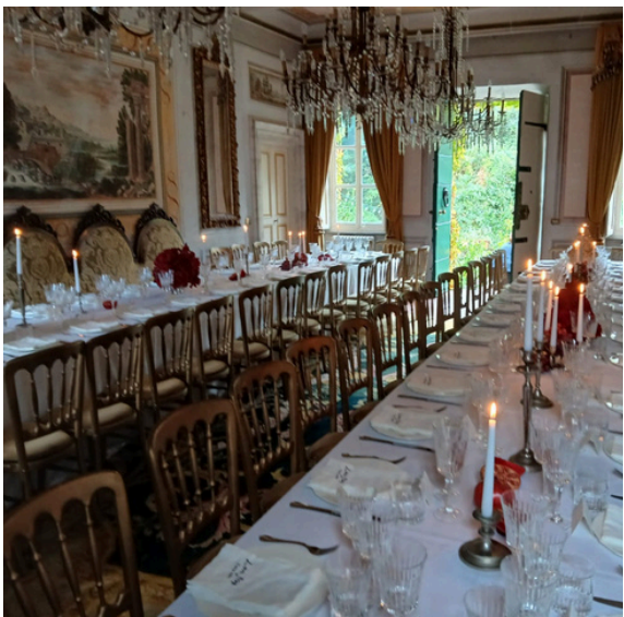
Winter weddings in the frescoed dining room seating 70