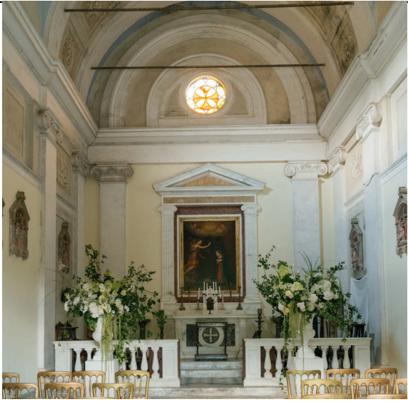
Our 18th-century chapel seating 60