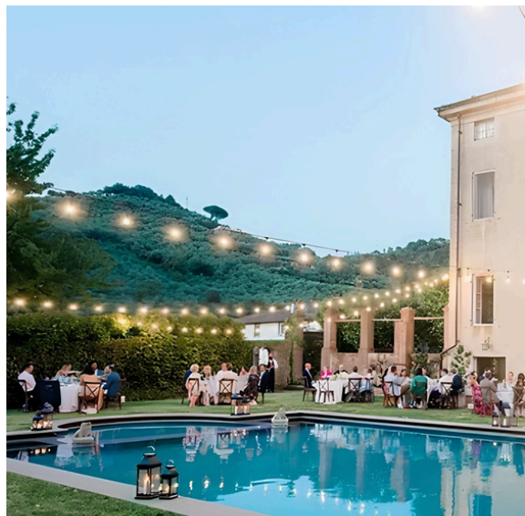
Ceremony in the garden, with the Apuan Alps beyond seating 70