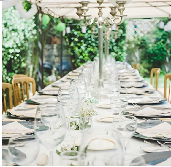
Dinner under the lemon trees for up to 80 guests